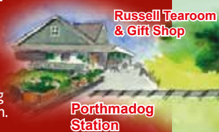
Russell Tearoom & Gift Shop

AT PEN-Y-MOUNT: you are invited to alight from the train and are encouraged to lend a hand! The driver may hand you the token to give to the Guard, who will then show you how to change the points and signals.